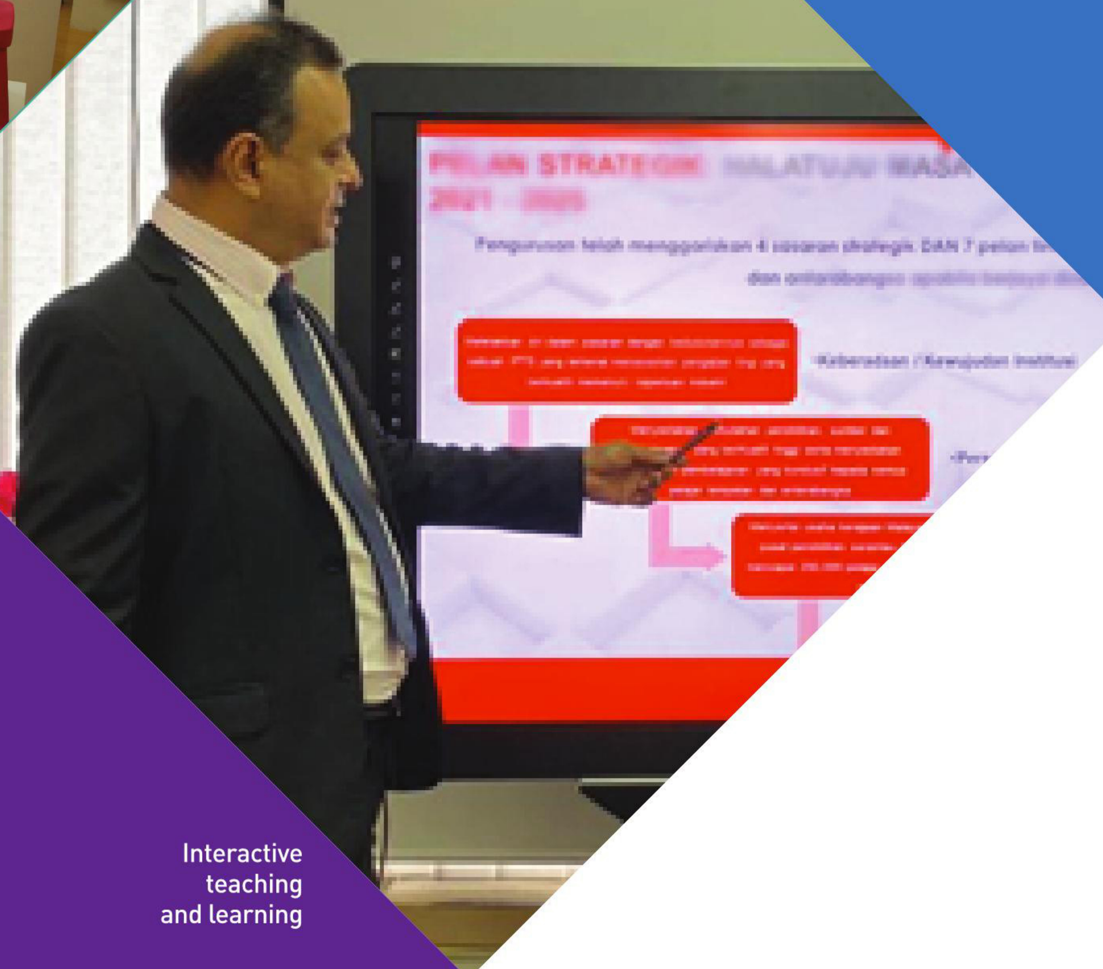
Interactive teaching and learning